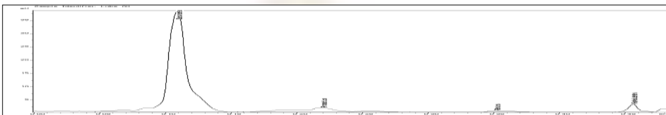
Typical SARA chromatogram of fresh lube oil